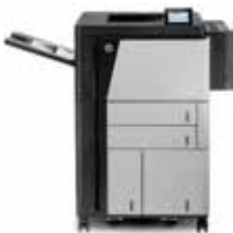
HP LaserJet Enterprise M806x+ NFC/Wireless Direct Printer