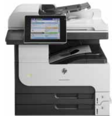
(HP LaserJet Enterprise MFP M725dn shown)

Mobile printing capability: HP ePrint, Apple AirPrint™