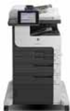
HP LaserJet Enterprise MFP M725f