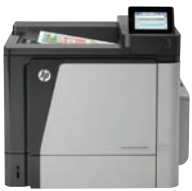
HP Color LaserJet Enterprise M651dn