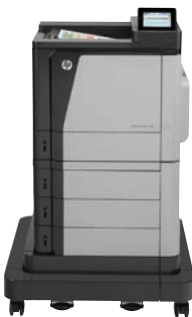
HP Color LaserJet Enterprise M651xh