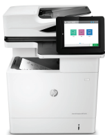
HP LaserJet Enterprise MFP M635h