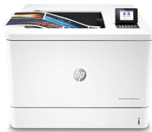
HP Color LaserJet Managed E75245dn

HP LaserJet printers power office productivity with a smart, streamlined design that's reliable and hassle-free. Count on premium quality, maximum uptime, and the strongest security—all intended to drive successful organizations forward.