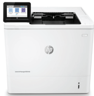
HP LaserJet Managed E60165dn

Dynamic security enabled printer. Only intended to be used with cartridges using an HP original chip. Cartridges using a non-HP chip may not work, and those that work today may not work in the future. http://www.hp.com/go/learnaboutsupplies