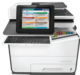
HP PageWide Managed Color Flow MFP E58650z