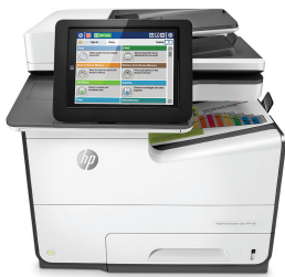
HP PageWide Managed Color MFP E58650dn

HP Managed MFPs and printers are optimized for managed environments. Offering increased monthly page volumes and fewer interventions, this portfolio of products can help reduce printing and copying costs. See your HP Authorized Reseller for details.