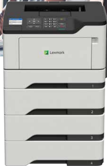
B2546dw with optional trays