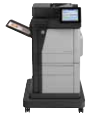
HP Color LaserJet Enterprise MFP M680f